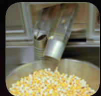
Soccer Pro is manufactured to cGMP standards