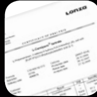
L-Carnitine C of A

We demand Certificates of Analysis for each ingredient and have full traceability of all materials in the product. In our production facility, we perform analytics on our active ingredients before they are released for manufacturing.