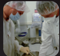
Soccer Pro quality testing