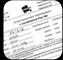
Analytics report for L-Carnitine